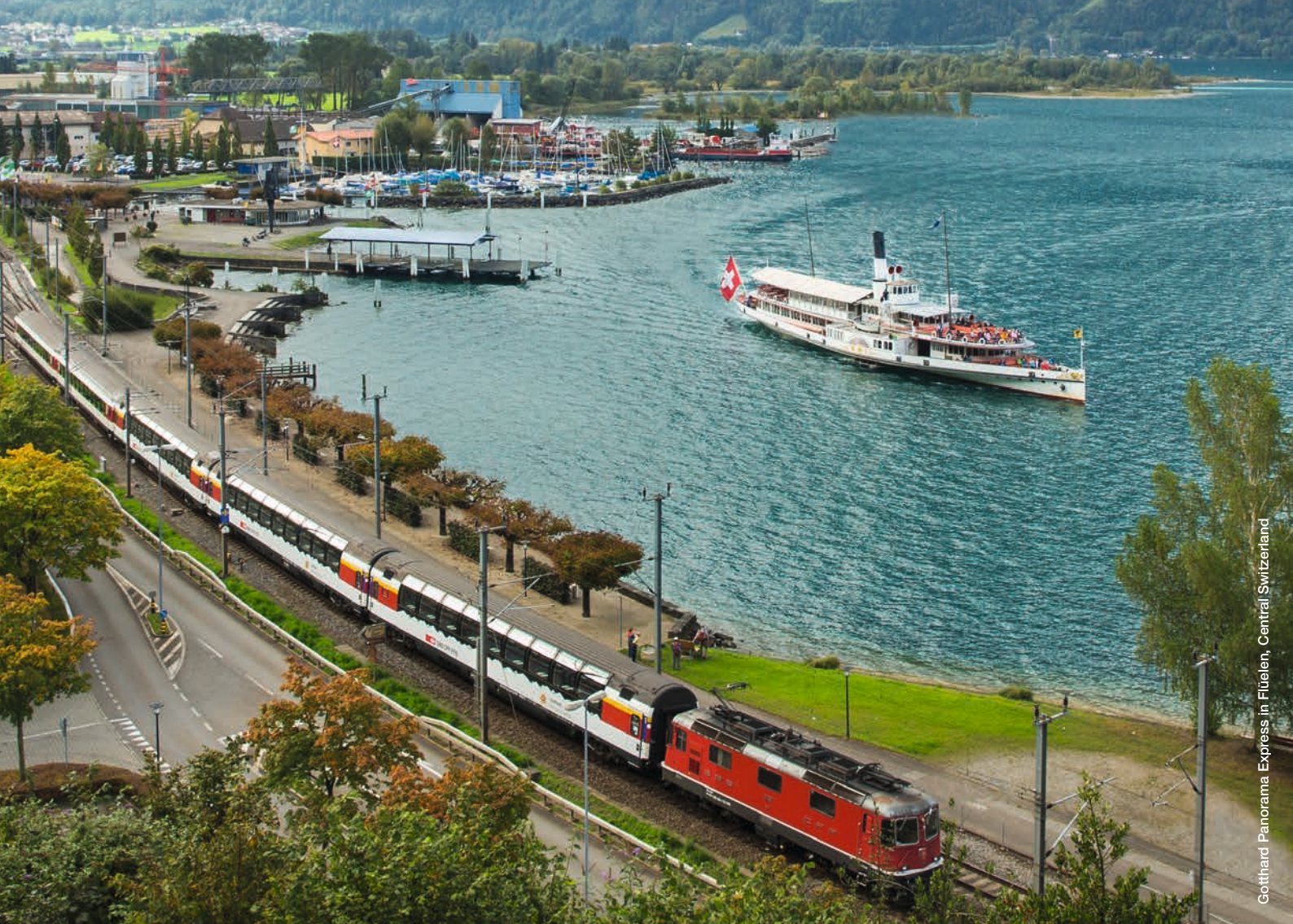
Gotthard Panorama Express in Fluelen, Central Switzerland